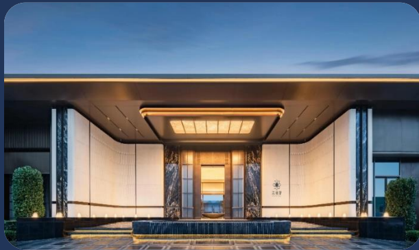
Jinan Poly Jinmao Splendid Jade

The Group acquired three high-quality projects in Jinan in mid-2024, all launched to market in October. Partnering with renowned developers such as Jinmao and Greentown, the three premium projects—Poly Jinmao Splendid Jade, Poly Glory of Praise and Poly Greentown Phoenix Mansion—were developed, enhancing both project quality and development efficiency. These projects, recognized for their superior product offerings and precise market positioning, received strong customer recognition. As of the end of November, total contracted sales of the three projects reached approximately RMB1.3 billion, with individual project sell-through rates between 40% and 60%.