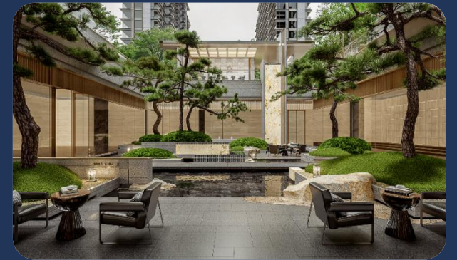
Jinan Poly Greentown Phoenix Mansion