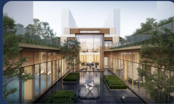
Jinan Poly Glory of Praise